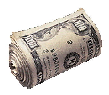
I think 48 thousand should have been close enough, don't you?

As I walked away, I wondered to myself what in the hell is the difference between 48 thousand and 50 thousand when you are that much ahead?